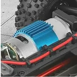
560 Strong Magnetic Motor